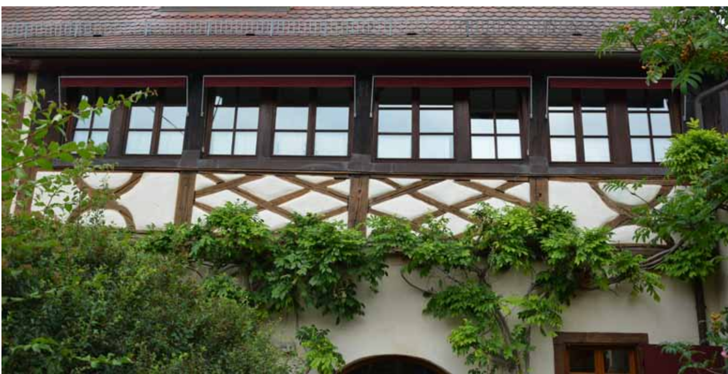
The balcony-deck decorated with crossed diamonds and curule chairs

The upper levels are half-timbered. From a decorative point of view, we can see the "Mann" figure and a curule chair, sign that this house was inhabited by a notable of the village. The behind part dated back to the end of the seventeenth century or the beginning of the eighteenth. To the yard side, a balcony-deck is decorated with two curule chairs and a double design of crossed diamond, sign of luck to assure the fecundity of the house's inhabitants and the animals, but also good harvests.